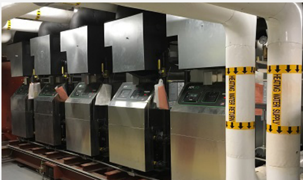
Five new 3,000 MBH KN Series Hydrotherm boilers were installed to generate hot water for the Aquarium's buildings and exhibits.

The HVAC cooling system employed two centrifugal chillers. Three sectional cast-iron boilers generated heating water for general space heating. The boiler plant also generated heating water that was used for domestic hot water and to control the temperature in the aquarium exhibits' life support systems. As such, redundancy and reliability in the boiler plant were essential for day-to-day operations.